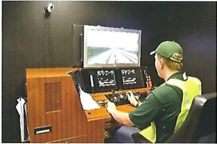
Operating a simulator at the Amtrak Training Center