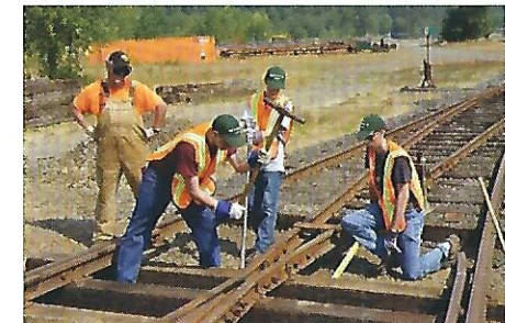
Track work at Mt. Rainier Railroad & Logging Museum, Mineral, WA