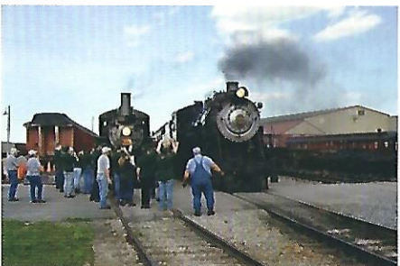
A day at Strasburg Rail Road