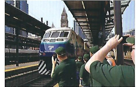
King Street Station, Seattle, WA