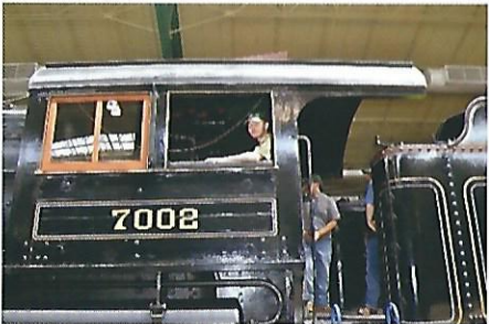
Railroad Museum of Pennsylvania