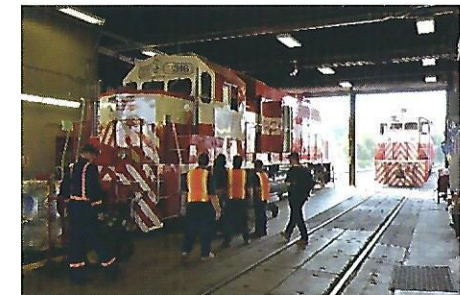
Tacoma Rail Locomotive Shop