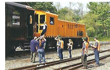
Northwest Railway Museum, Snoqualmie, WA