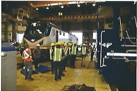
Amtrak's Wilmington Locomotive Shop