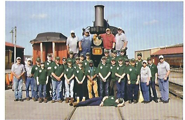
RailCamp East Wilmington, DE