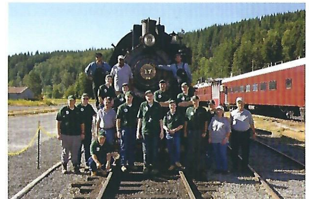
RailCamp Northwest Tacoma, WA